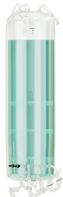
Single Use STR eBAG 100L - 1000L

TECNIC's eBAG 3D STR is specially designed for seamless integration with our single-use bioreactor systems , addressing the unique demands of mammalian and microbial bioprocessing with unparalleled efficiency. Manufactured in an ISO7 cleanroom, these bags ensure sterility and are available in sizes from 100L to 1000L, covering a broad spectrum of bioprocessing needs.