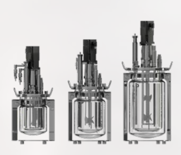
Borosilicate Glass 1/2/5/10 L