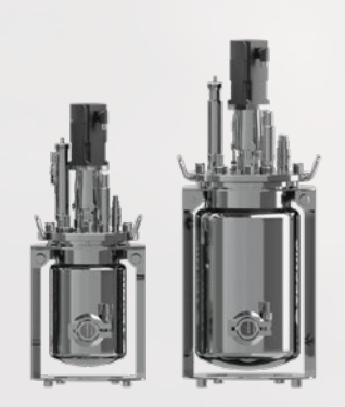
Stainless Steel 2 / 5 L

Versatile and reliable bioreactor vessels for bioprocessing.