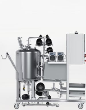
ePlus CIP Automated Cleaning In Place System 100 / 200 L

Maximise the scope of your bioprocesses with TECNIC's ePlus solutions, tailored to suit every requirement.