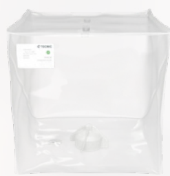
eBAG 3D Mixer