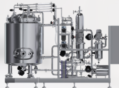
ePlus Media Preparation Automated Media Preparation Station

System designed for precise control over critical process parameters, including pH, conductivity, temperature, weight, and agitation speed. Tanks are compatible with our eBAG 3D, ensuring reliable performance, sterility, and flexibility for various bioprocessing applications.