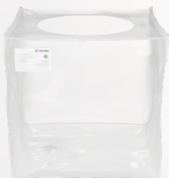
eBAG 3D Open

The fully automated ePLUS Media Preparation system ensures precise mixing and sterilization of culture media. It is ideal for buffer and media formulation, offering time-saving benefits, precise dosage control, and traceability to ensure media quality.