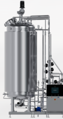
ePlus Buffer Up to 4000 L Automated Buffer Tank

A fully automatic, easy to use cleaning-in-place system. Efficiently cleans equipment with volumes up to 2000L, ensuring high standards of hygiene.