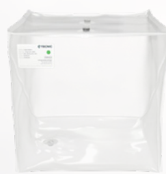
eBAG 3D Storage

Our eBAG line is designed to seamlessly integrate with the ePlus Mixer, offering a reliable solution for bioprocessing needs. Manufactured in our ISO7 cleanroom facilities, our single-use consumables meet the industry's highest standards for sterility and performance. With options tailored to various applications, eBAG ensures consistent and dependable results, making it an ideal choice for efficient mixing and bioproduction workflows.