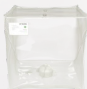
eBAG 3D Mixer