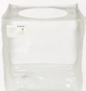
eBAG 3D Open

The fully automated ePLUS Media Preparation system ensures precise mixing and sterilization of culture media. It is ideal for buffer and media formulation, offering time-saving benefits, precise dosage control, and traceability to ensure media quality.