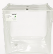
eBAG 3D Storage

Our eBAG line is designed to seamlessly integrate with the ePlus Mixer, offering a reliable solution for bioprocessing needs. Manufactured in our ISO7 cleanroom facilities, our single-use consumables meet the industry's highest standards for sterility and performance. With options tailored to various applications, eBAG ensures consistent and dependable results, making it an ideal choice for efficient mixing and bioproduction workflows.