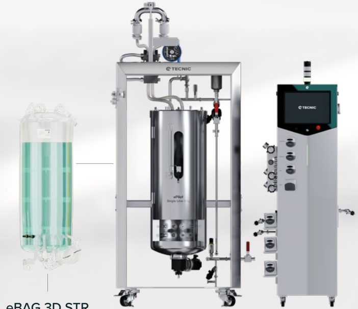
eBAG 3D STR

High-performance automatic bioreactor with cellular and microbial configurations, an excellent choice for pilot scale development and production.