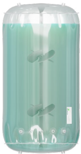
Single Use STR eBAG® 100L - 1000L

TECNIC's eBAG® 3D STR is specially designed for seamless integration with our single-use bioreactor systems , addressing the unique demands of mammalian and microbial bioprocessing with unparalleled efficiency. Manufactured in an ISO7 cleanroom, these bags ensure sterility and are available in sizes from 100L to 1000L, covering a broad spectrum of bioprocessing needs.