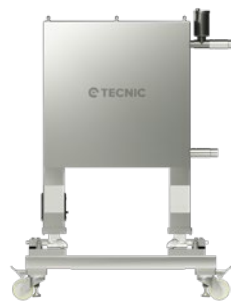
200 L Tank