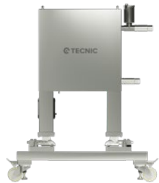
100 L Tank