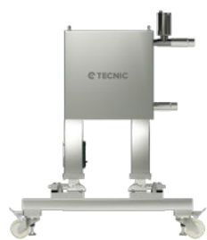
50 L Tank