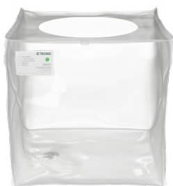
eBAG® 3D Open