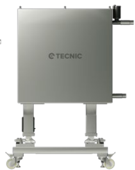
500 L Tank